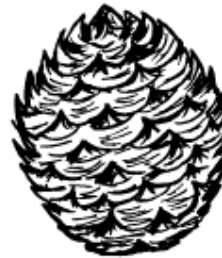
female cone (X 1/5)