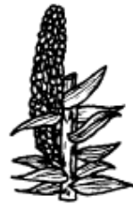
male cone (X 2/3)

Gummingurru is on the traditional lands of the Jarowair people. Jarowair would welcome Aboriginal clans from all around and allow them to stay to prepare for the bunya celebrations. As part of the initiation, every boy would be given a totem that would connect him with his country. This is a very important process in becoming a man. The totem (locally known as yuree) that was assigned would become a significant responsibility for the young man, who would be given the task of managing that yuree and its habitat. This would create a process of nature conservation unparalleled in today's world. At the Gummingurru site there are many totems created by the stone arrangements formed into motifs. One of these is the Bunya Nut.