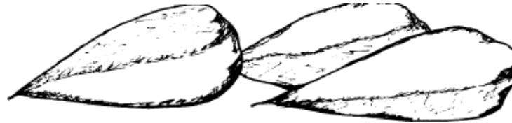
Bunya Nuts (actual size)

The Bunya Nut motif is the most northerly stone arrangement on the site, north-east of the Carpet Snake head. The pear shaped nut points in the general direction of the Bunya Mountains. There is a stone arrangement site map located on the back page so check out the motifs yourself.