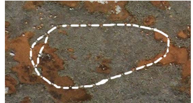
Bunya Nut arrangement.

The Bunya Nut motif is the most northerly stone arrangement on the site, north-east of the Carpet Snake head. The pear shaped nut points in the general direction of the Bunya Mountains. There is a stone arrangement site map located on the back page so check out the motifs yourself.